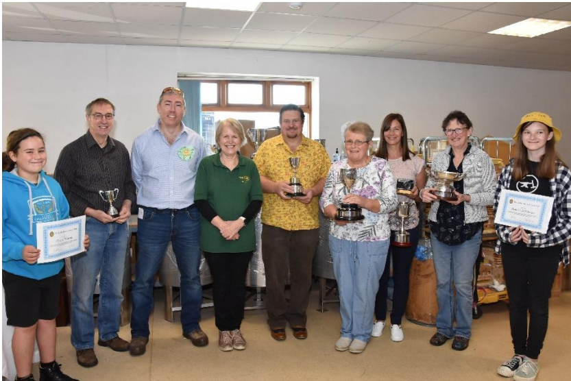
2021 Trophy winners